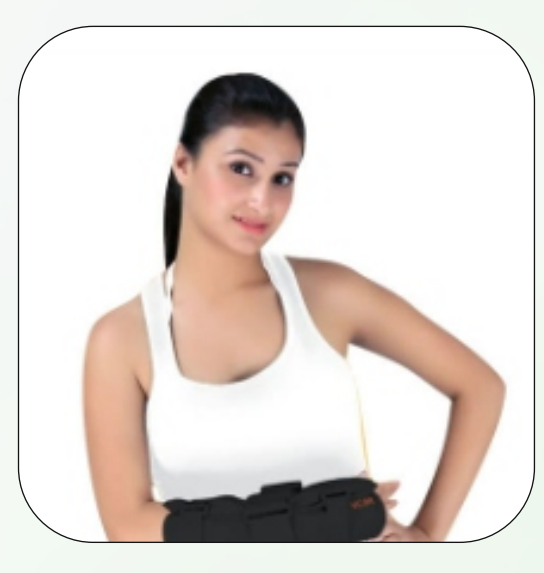
Wrist And Forearm Splint