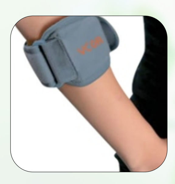
Tennis Elbow Support