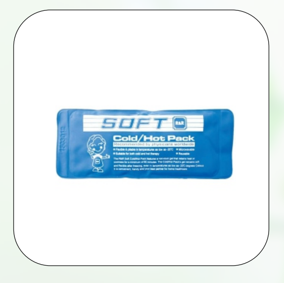
Hot And Cold Pack