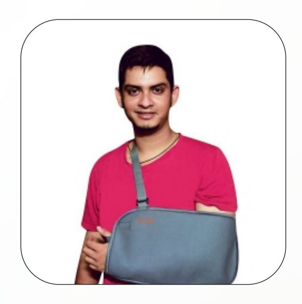
Arm Sling Pouch