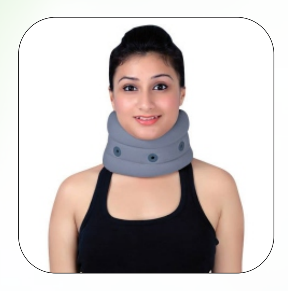
Cervical Collar Soft